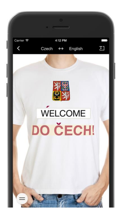
Figure 2. Visual text translation

Mobile application has the same functionality and moreover, there is a possibility to download an offline dictionary with examples of common usage. A user can also dictate the text, then the application recognize speech and translate the input. Furthermore, it provides visual text recognition that works for 11 languages so far, allowing instant translation from a picture. The application access the camera rolls in mobile devices and import the photos to quickly scan and identify foreign text (such as that found in a sign or a menu), and then translate and display the words in another language on the device's screen. The words are displayed in the original context on the original background, and the translation is performed in real-time (Figure 2) [14] [15].