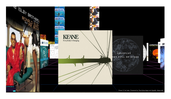
Figure 4. The Echo Nest lab, Maze experiment

Another surprising and creative application of the Echoprint system is the 3D music maze (see figure 3)[1]. This app is an experiment from The Echo Nest lab in using alternative interfaces for music exploration and discovery. The user can walk through a generated maze of 3D album art boxes. By walking close to the album art, the music of the album is being played. It uses The Echo Nest artist similarity and playlisting APIs to build logical clusters of artists and songs. It uses the 7Digital media [2] for the album art and 30 second samples and three.js [8] for all the 3D modelling.