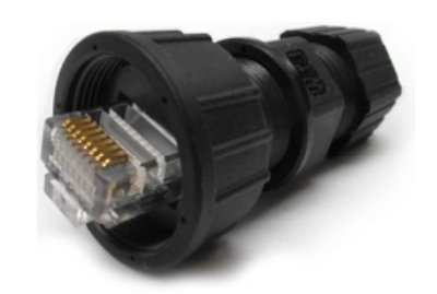
Assembled RJ45 cable connector on cable