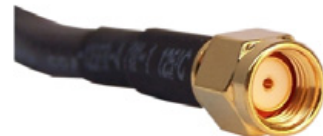
Gold plated RP-SMA