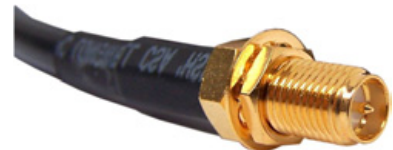
Gold plated RP-SMA chassis