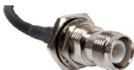
Chrome- and gold plated RP-TNC chassis