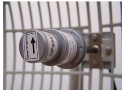
Fast and easy adjustable polarization