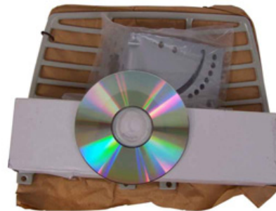
Small shipping size (cd not included)