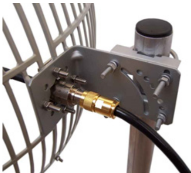
The beam angle is very easy to change with the adjustable antenna mount.