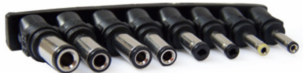
Easily changeable different plug sizes