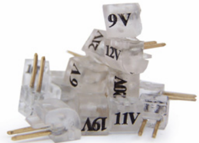
Output Voltage selectable by changing plugin