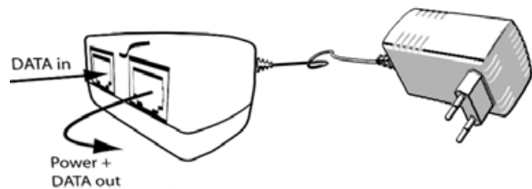
Power over Ethernet solutions