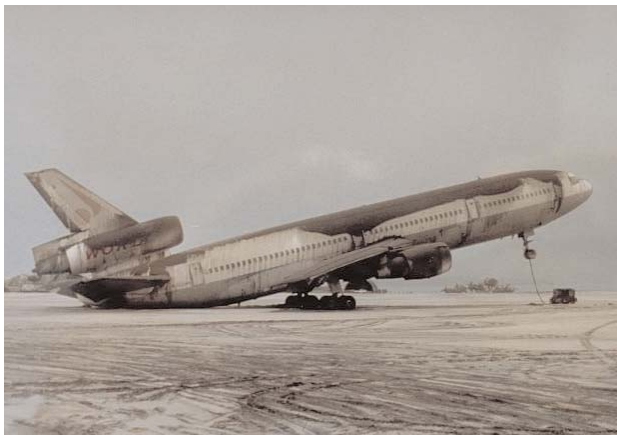
Figure 2. Heavy ashfall from the 1991 eruption of the Pinatubo volcano in the Philippines caused this World Airways DC-10 to set on its tail. About 4 cu km of ash was erupted on 15 June. It accumulated to depths of 10-15 cm at this airfield at the Cubi Point Naval Air Station, 40 km SSW of Pinatubo.

From all these considerations it is clear that the safest procedure for aircraft is to stay clear of volcanic clouds. But pilots cannot always see an ash cloud, e.g. at night, and the ash does not show up on radar. And \text{SO}_2 and \text{SO}_4\text{H}_2 are colourless gases, therefore invisible. If it penetrates into the aircraft, sulphuric acid is noticed easily because of its strong smell, but then the aircraft is already inside the cloud. Hence, it is of major importance to know in advance where volcanic clouds are and what elevation they reach.