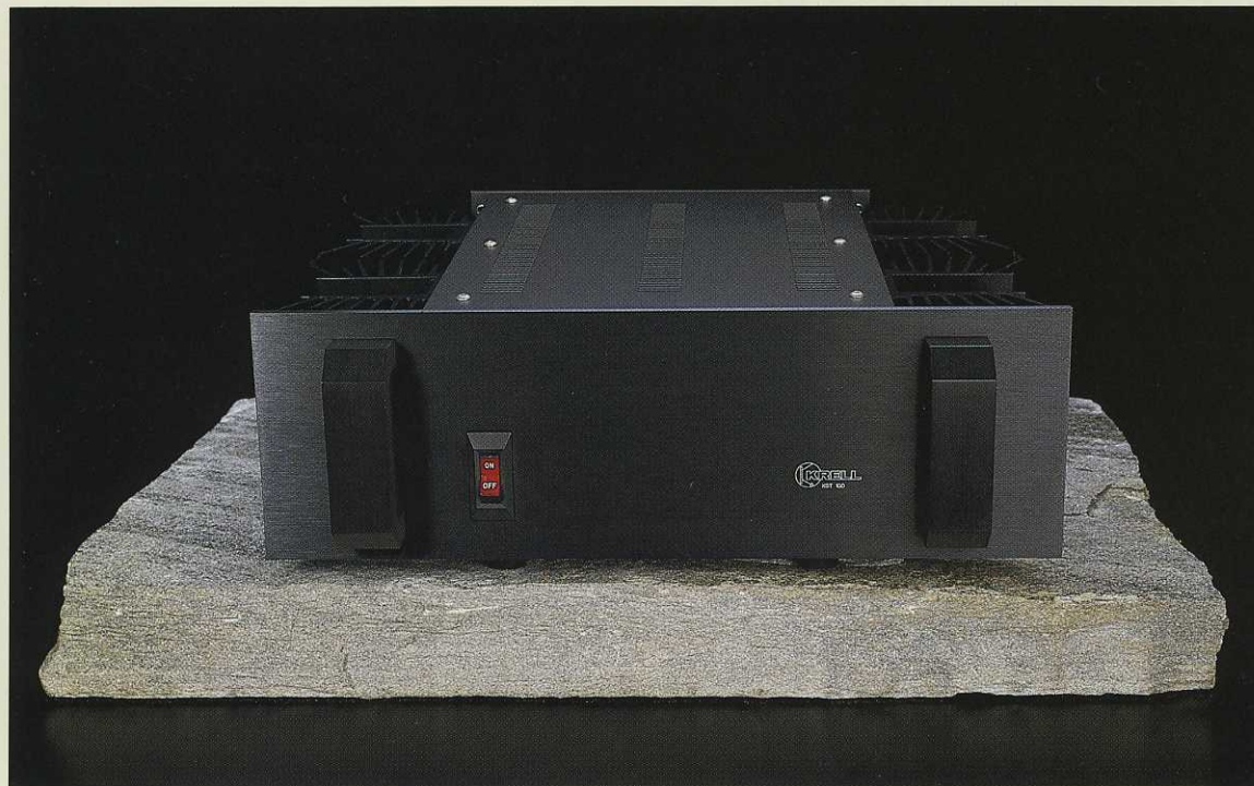
KST-100 Stereo Amplifier— The graceful front handle is a proprietary Krell design.

The KSL and KST-100 are covered by a five year transferable warranty that covers parts, labor and return freight. Part of every Krell, however, is premium service for every product, regardless of age. Purchasing high-end audio equipment is a significant investment. Krell justifies that investment by delivering superior sonic performance, long-term reliability and consummate service for the life of every product.