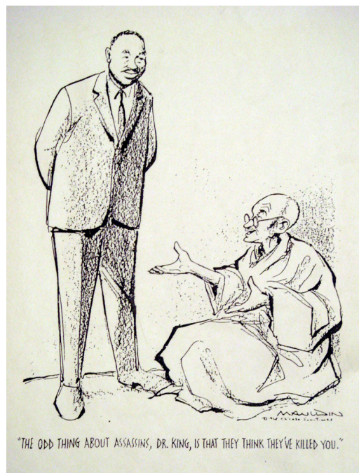
Bill Mauldin cartoon published in the Chicago Sun-Times the day after Martin Luther King Jr.'s assassination, April 5, 1968

Gandhi has, however, had to be killed repeatedly. It may well be that is likewise the fate of others whom a nation seeks to exorcise. A cartoonist for the Chicago Sun-Times in the aftermath of the assassination of Martin Luther King Jr. appears to have understood this well: a seated Gandhi looks up to the slain civil rights leader and remarks, “The odd thing about assassins, Dr. King, is that they think they’ve killed you.” A modern nation-state has many ways to excise the memory of those who are most despised, resented, or feared. It is a criminal offence in Germany, for instance, to perpetuate the memory of Hitler, or take up his cause in any fashion. The case of Gandhi is, of course, far more complicated: as I have argued elsewhere, every constituency in India—Dalits, modernizers, feminists, Marxists, Hindu nationalists,