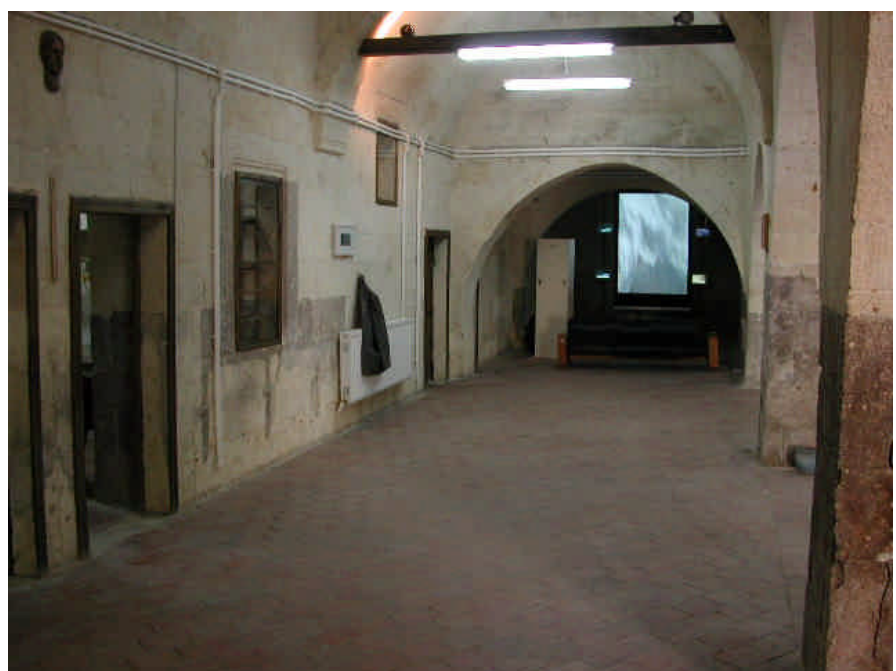
'Water as a lifeline' video installation 2008