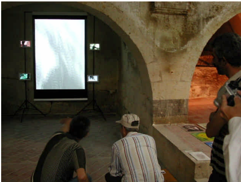
3d Contemporary Art festival Cappadocia, 'Kybele House'