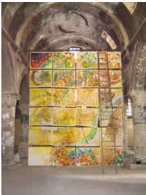
Art exhibition in the old Greek Eleni Church during the Mustafapasa Art Festival 2007

Beside this the Art ♦ Eco Platform focuses on the 5th World Water Forum , Istanbul, March 2009 and other activities in Istanbul, to present the Platform 'MAINSTREAM - Awareness by Art' professional artists contributions by speeches, workshops, exhibitions and audio-visual documentaries (by call for entry).