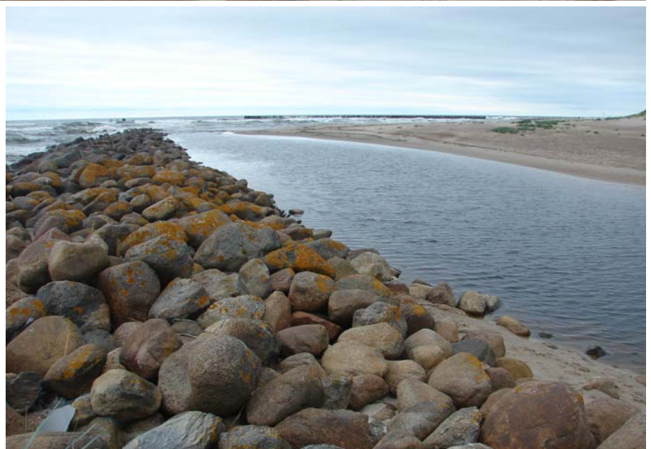
The coast at Pape with the channel for excess water disposal of the Papes ezers