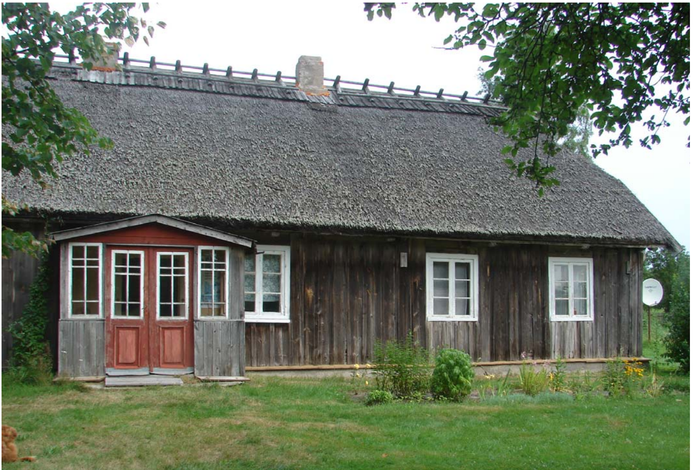
Museum Vitolnieki at Pape Latvia

This picturebook is dedicated to Baiba Reinfelde